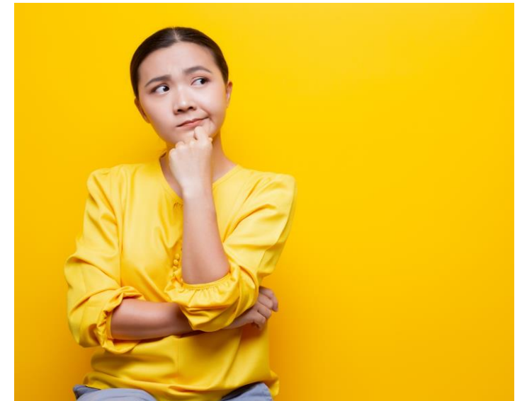
Team Management Consulting